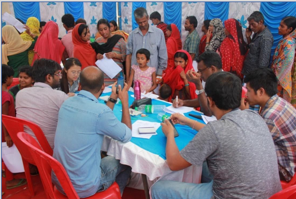
Community Medical Camps

We conducted community medical camps whenever and wherever possible, to provide treatment and medicines to poorer communities as general health services were not available during the first wave of the pandemic. Physical movement has been constrained by lockdown, and we were unable to access containment areas, but we were able to hold 20 camps (in 10 months), through which we reached 1,500 patients. Most of these patients were able to refill their prescriptions for oral anti-diabetic and anti-hypertensive medicines.