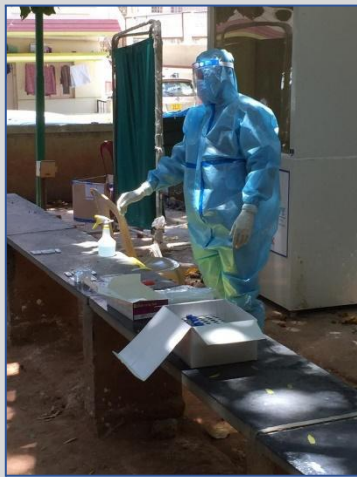
Anahat staff at testing sites

To help address the fear of testing and being hospitalized, Anahat collaborated with the government to run community testing camps. Our teams consisted of a swab collector, a data entry operator, and a government doctor or nurse. Three teams worked 7 days a week for 9 months (June 2020 to February 2021). Our work was to set up a camp within communities to make covid testing services more accessible. During this 9-month period we were able to provide easy access to testing services for 271,000 people.