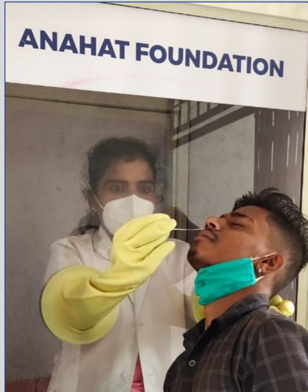
Covid testing in Roopenagrahara PHC using a Covid Testing Kiosk.