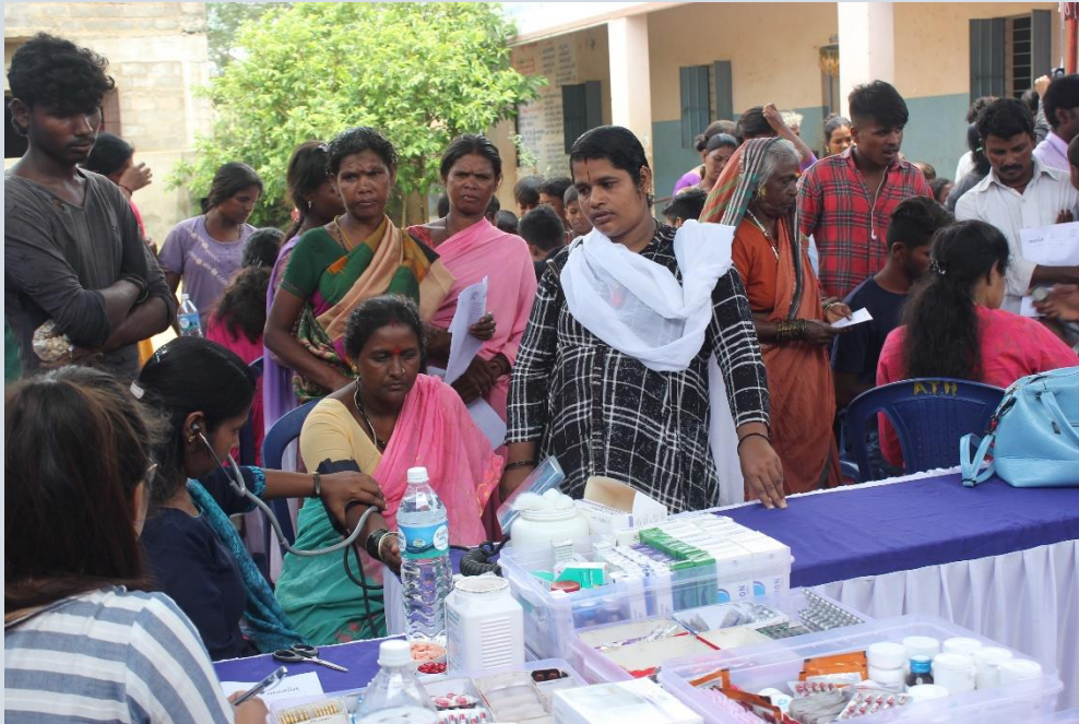
Community Medical Camps

We conducted community medical camps whenever and wherever possible, to provide treatment and medicines to poorer communities as general health services were not available during the first and second waves of the pandemic. Physical movement was constrained by lockdowns and the inability to access containment areas, but we were able to hold 20 camps through which we reached 1,500 patients. Most of these patients were able to refill their prescriptions for oral anti-diabetic and anti-hypertensive medicines.